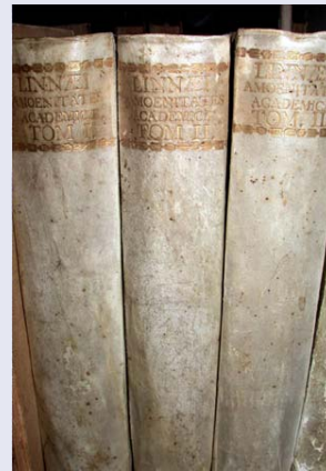
Volumes I, II, and III of Amoenitates Academicæ , by Carl Linnaeus, 1749

Our library is special, for it is the uninterrupted historical botanical library, as a part of the Leiden University, since 1575. It consists of a unique historical book collection and a modern collection that is divided in different scientific 'specialties'. We also have a huge collection of journals on these subjects, and thousands of illustrations, with many items from the hands of famous illustrators.