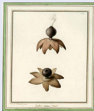
P.-J. Redouté (1759-1840) – Geastrum varians (March.), in: Champignons du Luxembourg, planches inédites de Pierre-Joseph Redouté , 1989.

Examples of non online resources are our card catalogue (discontinued since 2006) and BRAHMS, the herbarium database used in the library for referencing journal articles containing plant names, and linking to our digitized image database.