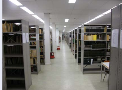
Reading room and Herbarium library

The National Herbarium of the Netherlands is the research and expertise centre for plant biodiversity in the Netherlands. Our scientific institute's library holds the Herbarium botanical reference collection. The library serves a diverse clientele that includes, apart from our staff, students, and amateur botanists, many colleagues from sister institutes from all over the world (about 400 foreign visitors each year).