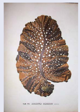
Alexander Postels, Franz Ruprecht – Agarum Gmelini , in: Illustrationes algarum... , 1840.