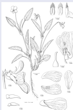
Esmee Winkel – Violaceae, Viola stagnina, var-stagnina , unpublished, 2008.