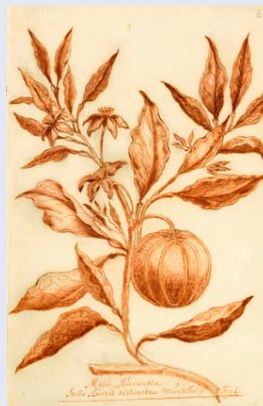
A. Munting – Red chalk drawing of Malus aurantia Stris Distincta , in: Nauwkeurige Beschrijving der Aardgewassen... , 1696.

The online resources consist of the OCLC Dutch Catalogue and the Leiden University catalogue, which can be used for searching, borrowing and extending books and article copies of our collections. The library website ( www.nhn.leidenuniv.nl/index.php/library ) contains links to botany and natural science related catalogues, databases, and e-journals. These services have improved the accessibility of our library collection.